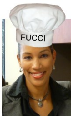
Team Fucci 49

We will be tracking the progress of these opportunities over the next few months so hopefully we will convert most of these to SALES! Prizes will go out later this week.