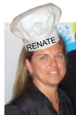
Team Cormier 18